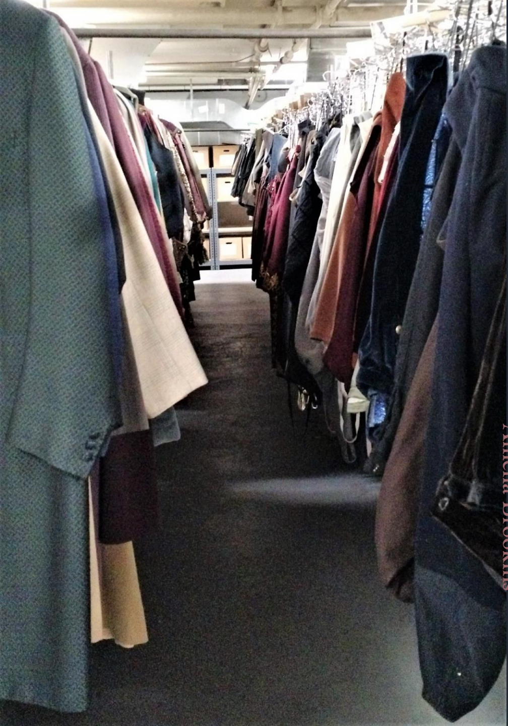
Example of costume house by Amelia Brookins